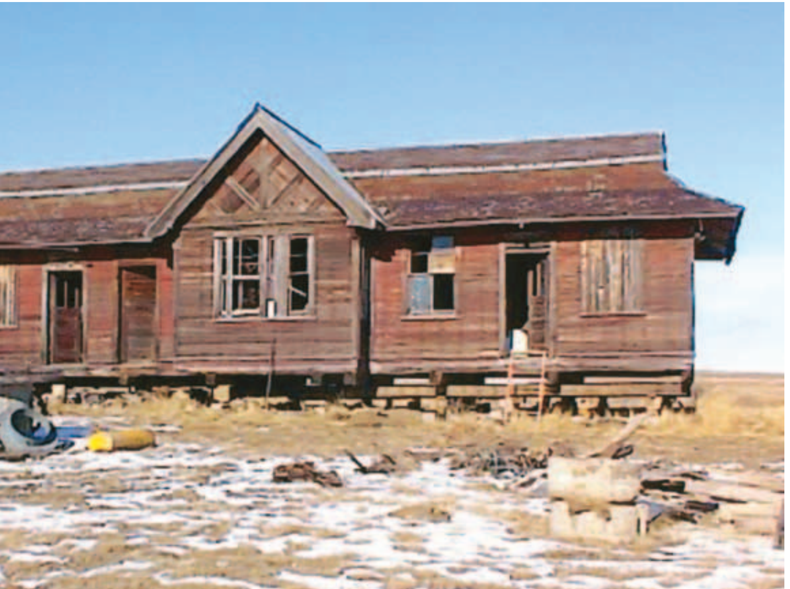
The Fort Pierre, South Dakota, C&NW Train Depot — Part 1 25