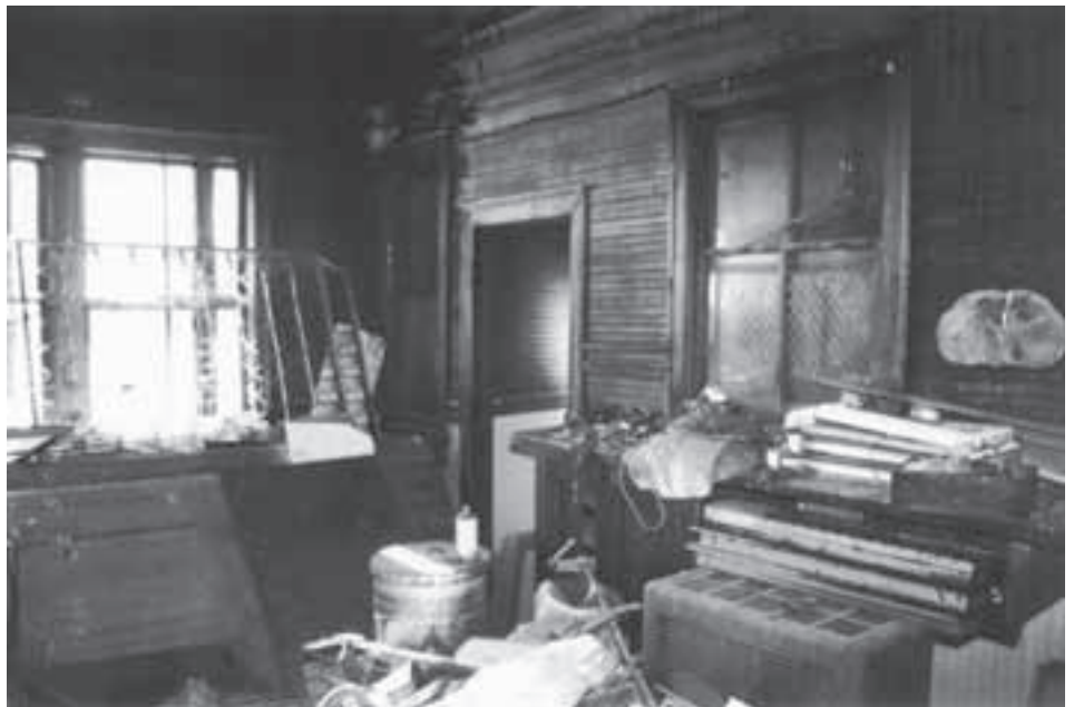
Above: This photo shows the interior of the agent's office inside the depot. The view looks toward the registration room. Behind the left ticket window is the registration room, and behind the right ticket window (not visible) is the women and children's waiting room.