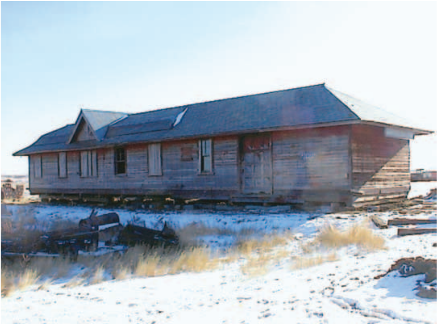
Above: This view of the depot sitting at Mud Butte faces east. Barely visible on the exterior of the freight room (right side of the freight room door) is the Western Union lettering.

and rehabilitation. But the museum board wanted to proceed with the project.